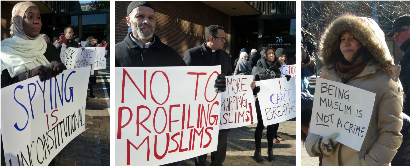
Rally outside Philadelphia Federal Court in support of Muslim civil rights and against NYPD surveillance based on religion. January 13, 2015.

Islamophobia has been escalating steadily over the past decade. Anti-Muslim hate groups grew from five in 2010 to 114 in 2017. Anti-Muslim assaults rose significantly between 2015 and 2016, exceeding the number of assaults reported in the year after the 9/11 attacks, effecting non-Muslims too, such as Sikhs . Muslim children are more likely to be bullied in school than children of other faiths. Media representations of Muslims are overwhelmingly negative, and the voices of people, like Black Muslims , who can better contextualize Islamophobia within the history of the United States, are consistently disregarded.